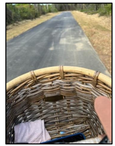
Arlene Klaas' View of the Trail