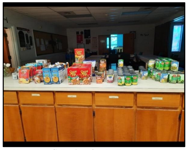
November Collections for the Food Pantry

December Luncheon Meeting food collections for the Food Pantry.