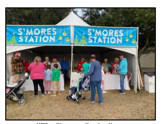
"The S'mores Station"